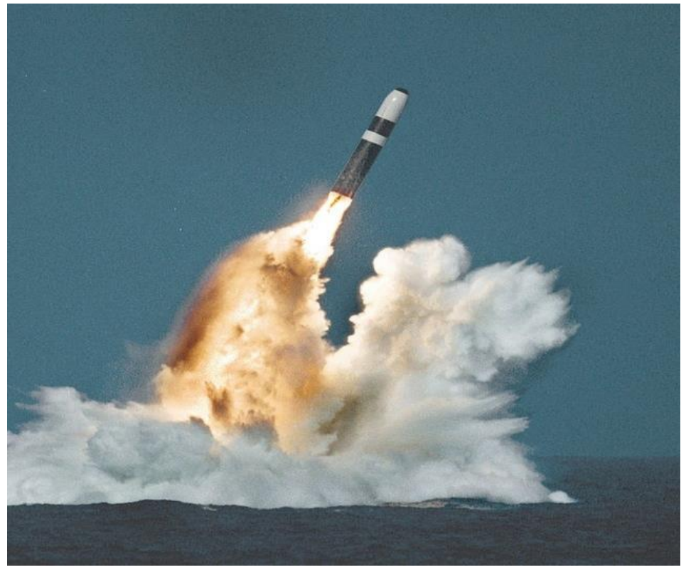
A Vanguard firing a Trident II Missile