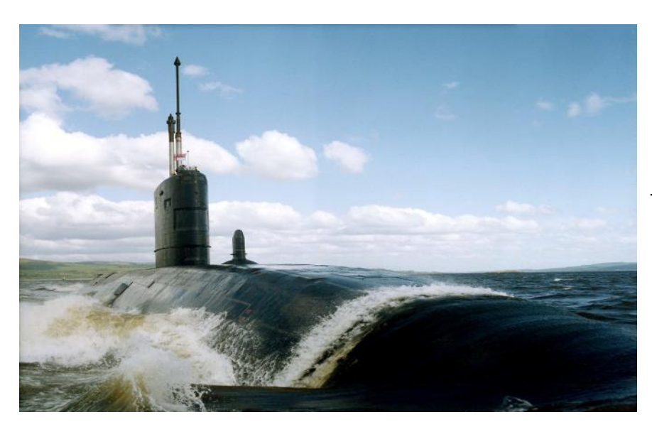
The Suberb submarine at sea