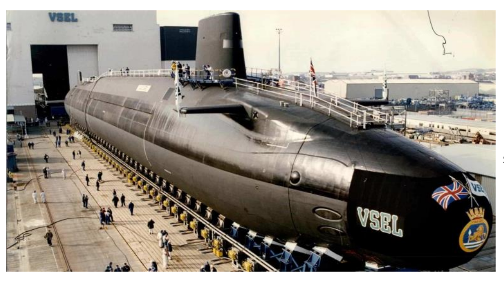
The Vanguard submarine ready for delivery