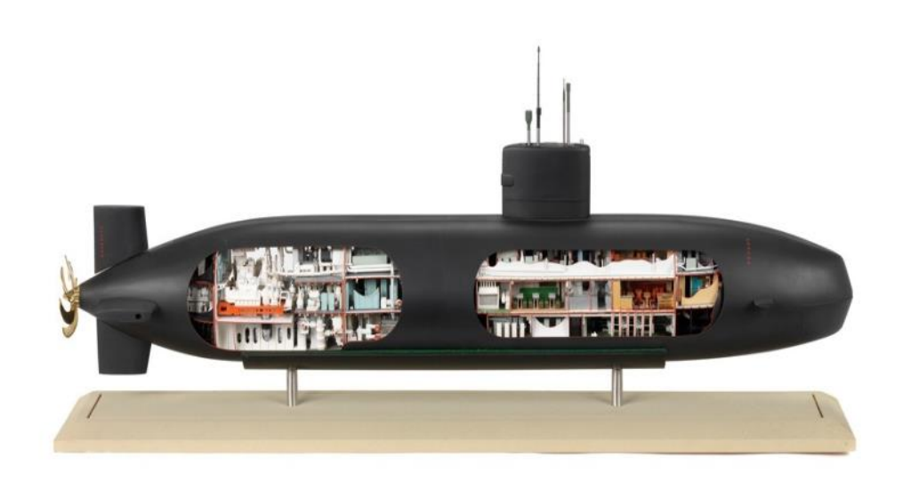
A model of the Superb submarine design.