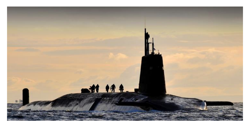
A Vanguard at sea