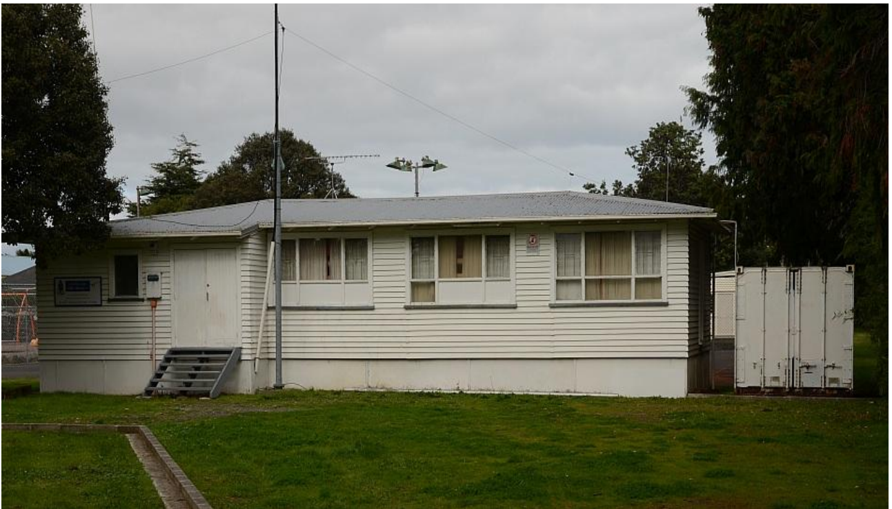
The VHF Group Clubrooms as at May 2015