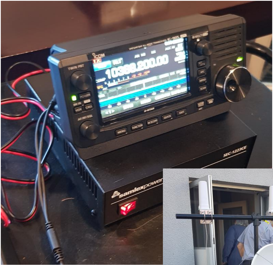
Above: ICOM 905 Control Head