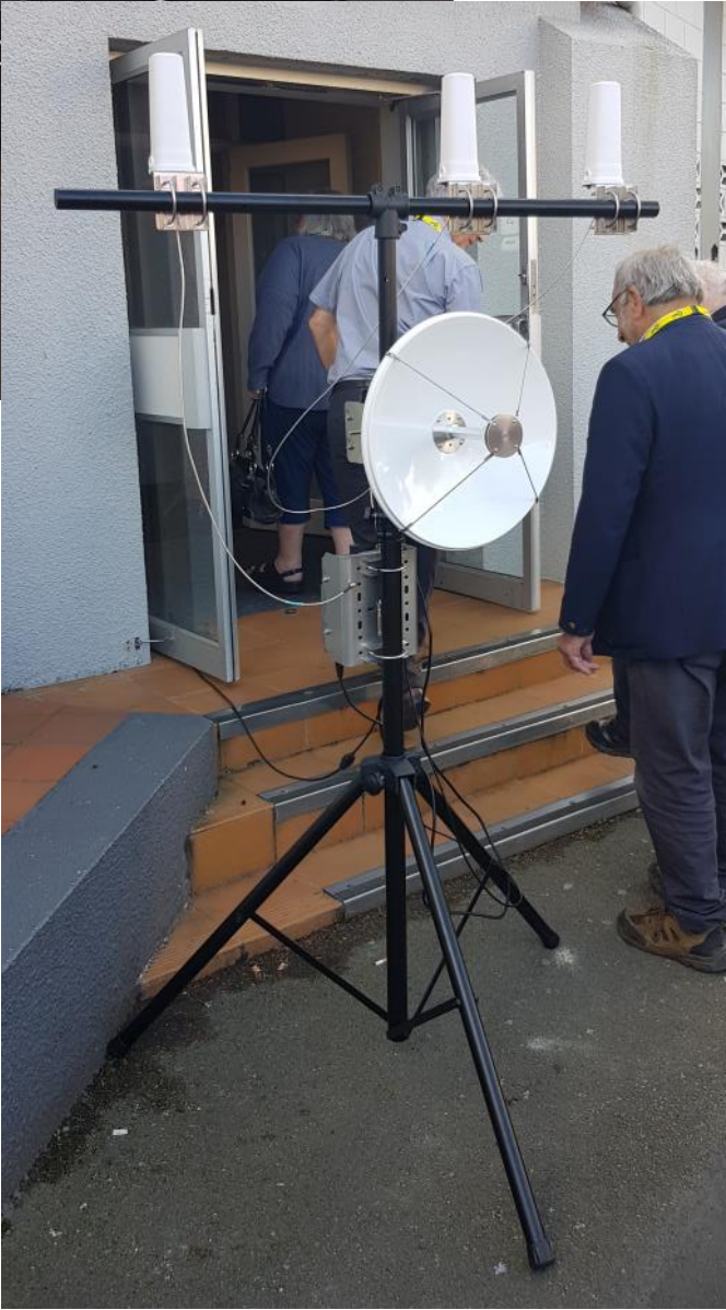
Right: 10 GHz Antenna