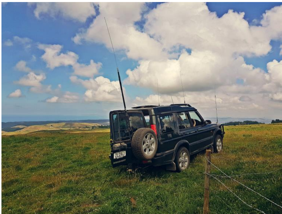
SOTA event Feb 2019

Club Contacts - page 2 Next Meeting - page 3 Presidents Column - page 4 Amateur Radio News - page 5