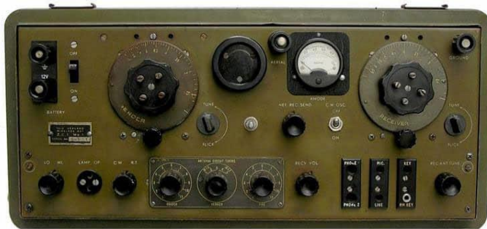
ZC1 Mk-1 Type 3.